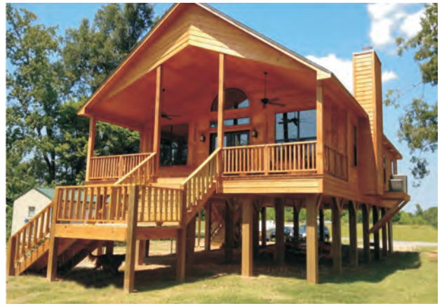
A stilt house

Stilt houses are found in heavy rainfall area. These houses are made on stilts, that are long poles of wood, so that rainwater cannot enter the houses. The roofs of these houses are made with slop so that the rainwater does not collect on them.